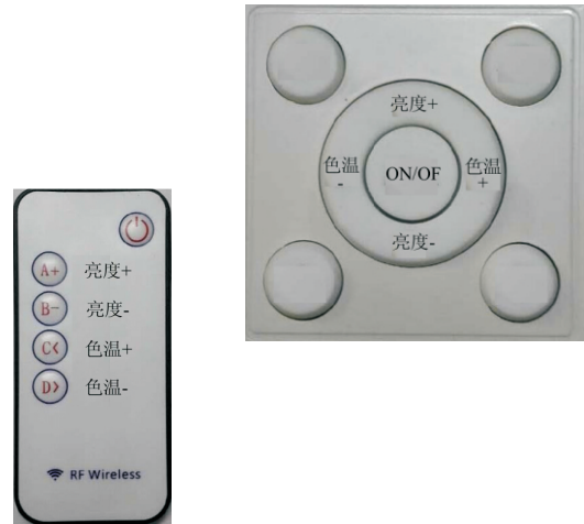
Model : CP-2.4G