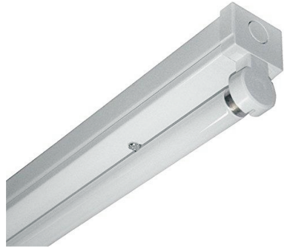
Model : DBA-S1218-E

This batten has a white gloss, powder coated finish and comes complete with polycarbonate end caps.